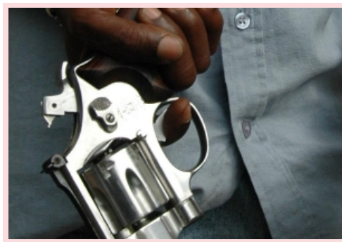
The Afflicted Yard \ Kingston 2002 – 2006