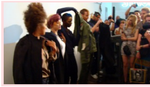
Models swapping jackets for Tunsi's "Live Look Book"