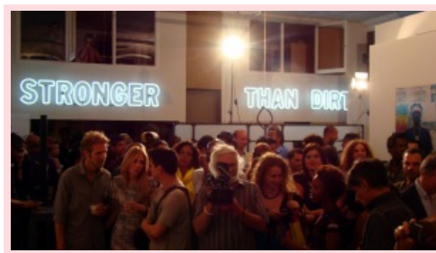
The Crowd at BITE, hosted at 3rd Streaming, 10 Greene St